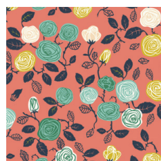
ROSES CORAL (binding)