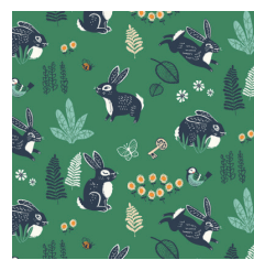
BUNNY HOP GREEN