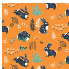
BUNNY HOP ORANGE