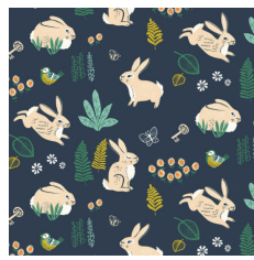
BUNNY HOP DUSK