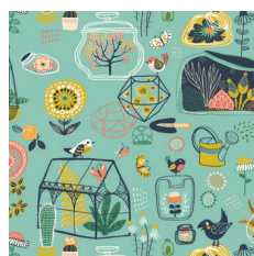
GLASS HOUSE (backing - not included as an appliqué leaf)